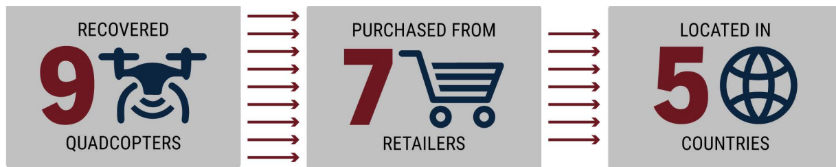
Figure 3: Islamic State Drones Recovered by and Retraced by CAR