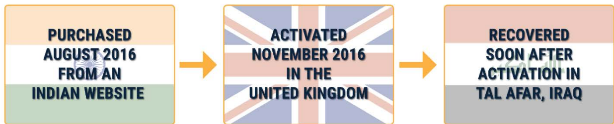
Figure 4: Life of an Islamic State Quadcopter Drone

The CAR sample, as well as other data, demonstrates how the countries involved in the various stages of the purchase-activation-use process varied across cases and potentially across time. For example, one of the two drones that Islamic State operatives purchased from a Kuwaiti e-commerce site during the 2015 to 2016 period was activated in Iraq. 106 But one of the drones the Islamic State purchased through an Indian website in August 2016 was activated in the United Kingdom that November. 107 And that particular drone, which was found in Tal Afar, Iraq, was found soon after its date of activation, indicating that the period between activation and use was not long. 108