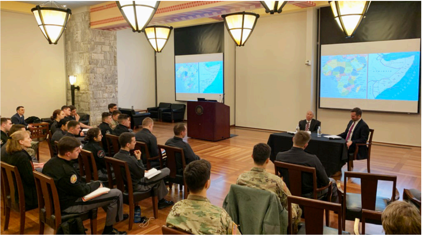
United States Ambassador to Somalia Donald Yamamoto is pictured during his February 2020 interview with Dr. Jason Warner at the United States Military Academy at West Point.

it is, in fact, moving away from a focus on looking at particular terror groups as the primary threat to U.S. national security to a new focus, to some extent, on near-peer competitors or great power competition. In other words, we're moving away from an era in which al-Qa`ida and transnational jihadi groups were looked at as the primary source of U.S. worry abroad, and increasingly, nation-state adversaries like Russia, China, and Iran are assuming that role. To the extent that that is the new outlook, how does the African continent figure into that? How do we think about the role of great-power competition or near-peer competition on the continent from your perspective?