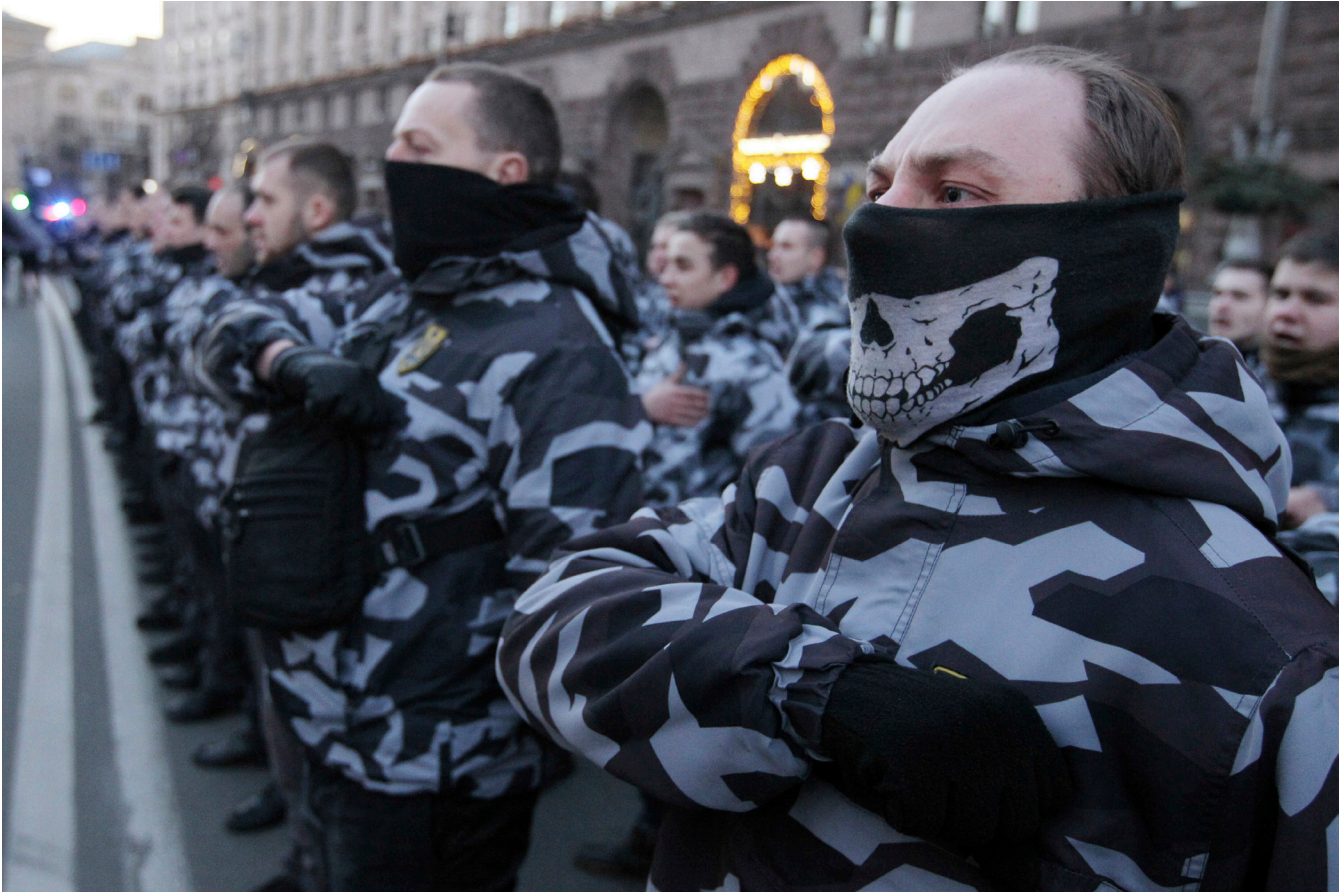
Activists of the Ukrainian far-right party National Corps are seen attending their march called “March of National Squads” at the Independence Square in Kyiv, Ukraine, on March 2, 2019.