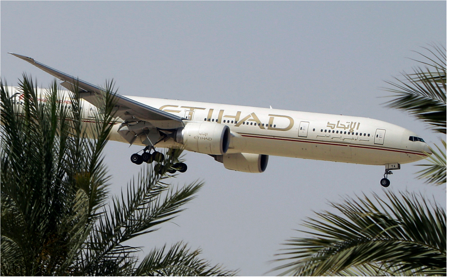
An Etihad Airways plane prepares to land in this file photo. The Islamic State attempted to bomb an Etihad flight leaving Sydney airport in July 2017.