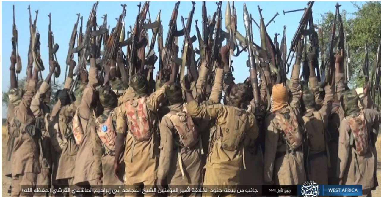
Islamic State media release showing Islamic State West Africa Province (ISWAP) fighters pledging allegiance to new Islamic State leader Abu Ibrahim al-Hashimi al-Qurashi following the death of Abu Bakr al-Baghdadi, published November 7, 2019.

project. By November 15, 2019, almost every African Islamic State province and non-province affiliate except for Algeria b had quickly pledged allegiance c to the Islamic State's new leader, Abu Ibrahim al-Hashimi al-Qurashi, who the U.S. government has identified as Amir Muhammad Sa'id 'Abd-al-Rahman al-Mawla. 1