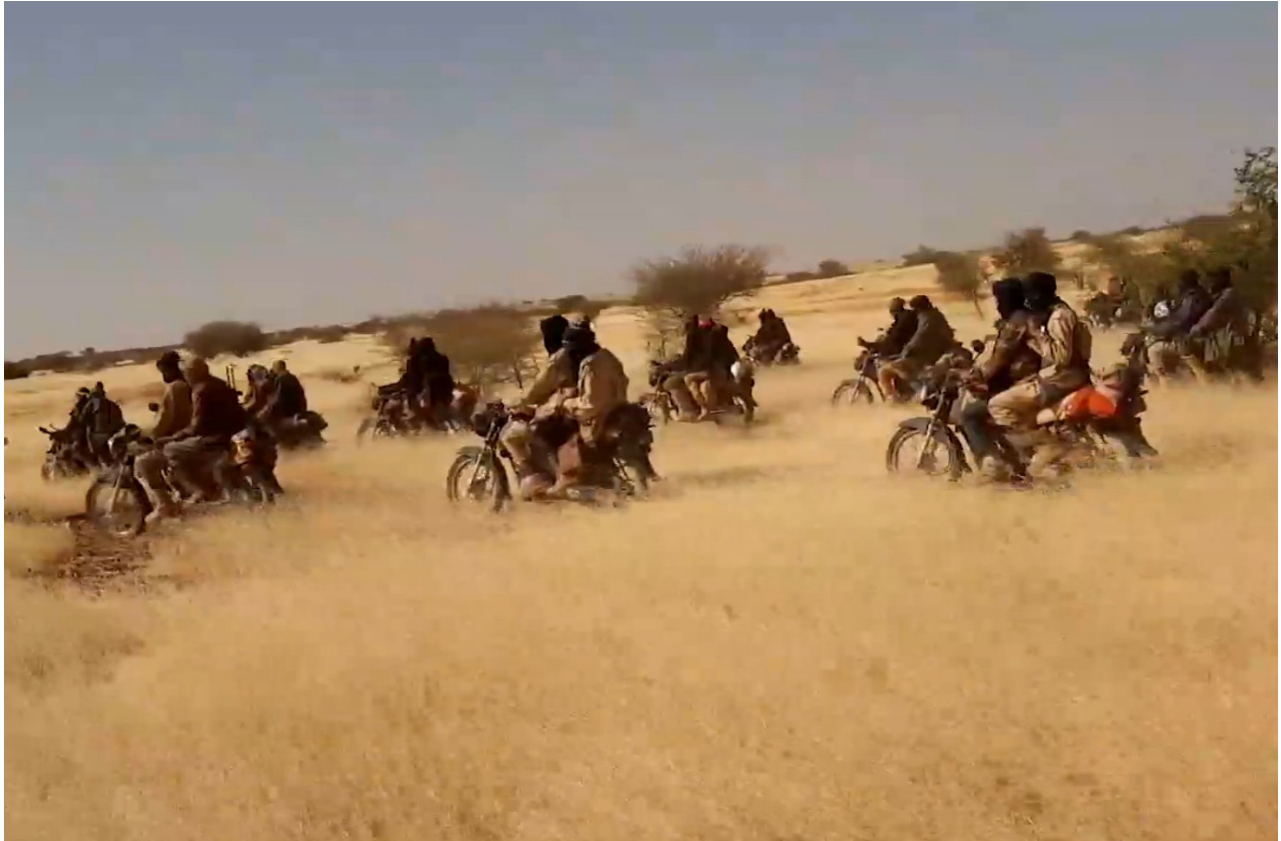
Screen capture showing the launch of an attack against a Nigerien army base on December 10, 2019, in the town of In-Ates, featured in the first official, full-length, high-quality video by the Islamic State dedicated to ISGS, entitled “Then It Will Be for Them A [Source Of] Regret,” released on January 10, 2020.

From being a small group—greatly underestimated and relatively shrouded in secrecy compared to its al-Qa`ida-aligned counterparts in the Sahel—there was a discernible change in ISGS’s capabilities in 2017. In that year, the group grew as it managed to mobilize a large number of fighters against the backdrop of intercommunal violence in the Mali-Niger borderlands, 75 and also received militants defecting from its Sahelian al-Qa`ida-affiliated counterpart, Jama’at Nusrat al-Islam wal-Muslimin (JNIM), a Sahelian jihadi conglomerate that served as a uniting umbrella group for five other factions. 76 Operationally, ISGS went from undertaking small hit-and-run attacks to much larger-scale, 77 coordinated attacks against military outposts across Niger’s northern Tillaberi region, including a particularly deadly ambush in Tirzawane in February 2017 that killed 16 soldiers, 78 spurring Nigerien authorities to request the deployment of French troops. 79 An ISGS ambush in the village of Tongo Tongo, Niger, in October 2017 targeting a joint U.S.-Nigerien force—which killed four U.S. Green Berets and five Nigerien counterparts—served to definitively thrust ISGS from relative regional obscurity to the headlines. 80