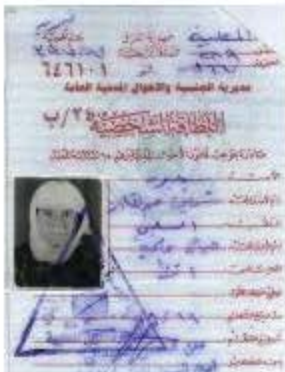
SSE#4- This is my wife's Iraqi Citizen ID.