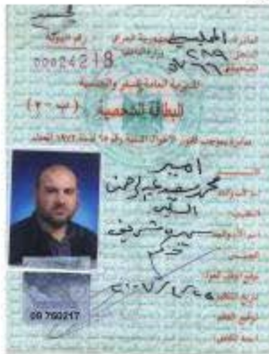
SSE #2- This is my son's Iraqi Citizen ID.