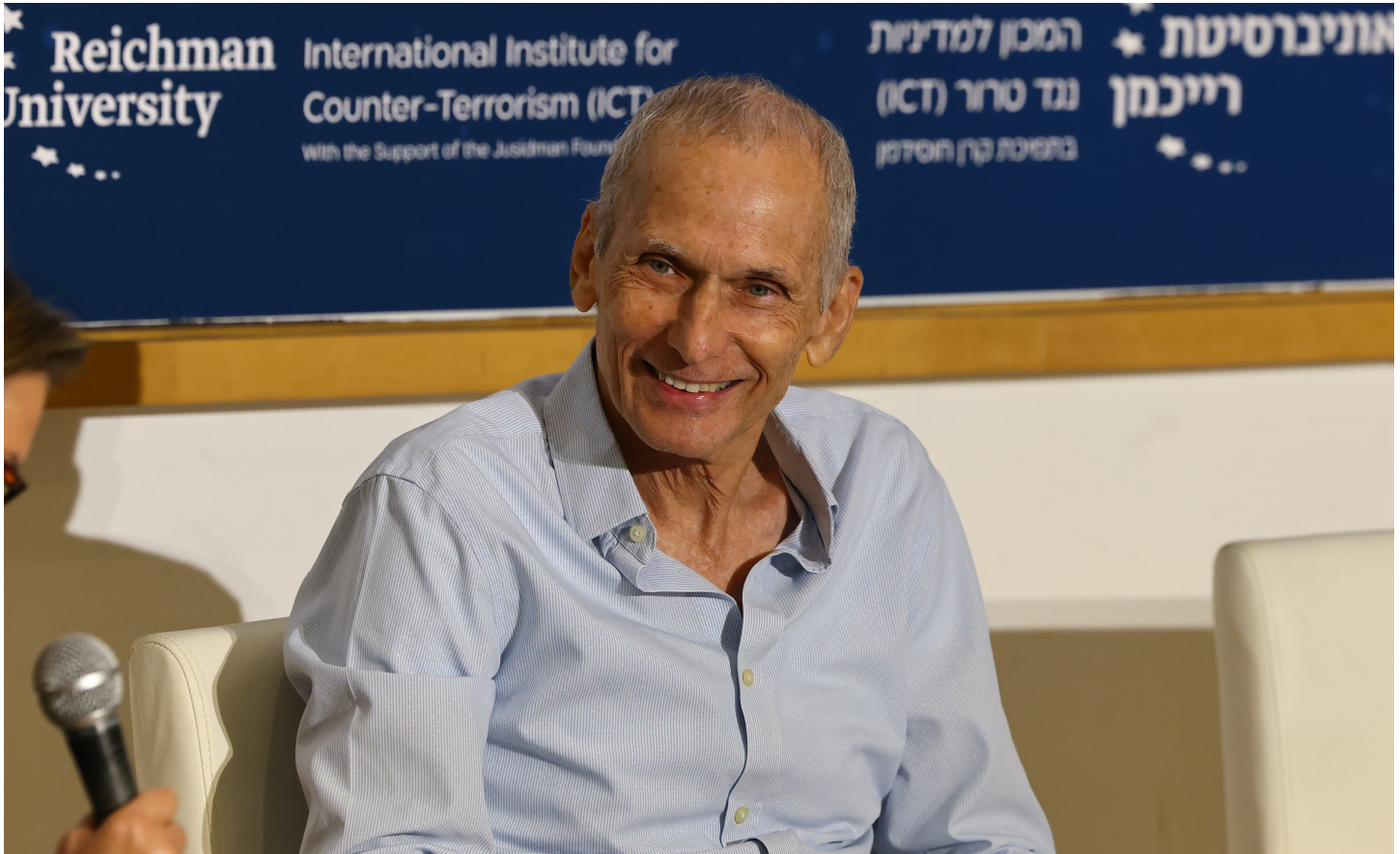
Omer Bar Lev

2022, we built and budgeted a plan to first equip the above eight companies and add over three years another 26 companies. The third “leg” is the Border Patrol volunteers, which are active mostly in the rural parts of the country and currently stand at about 7,000-strong. These volunteers will have their full gear at home so that within six hours they can be with their company where they are needed. We were able to accomplish that as well.