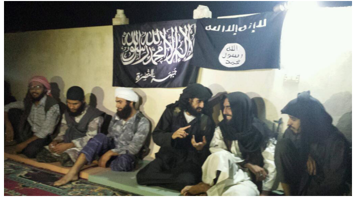
Members of the Islamic State of Iraq and al-Sham and Jabhat al-Nusra together during Eid al-Adha in mid-October 2013