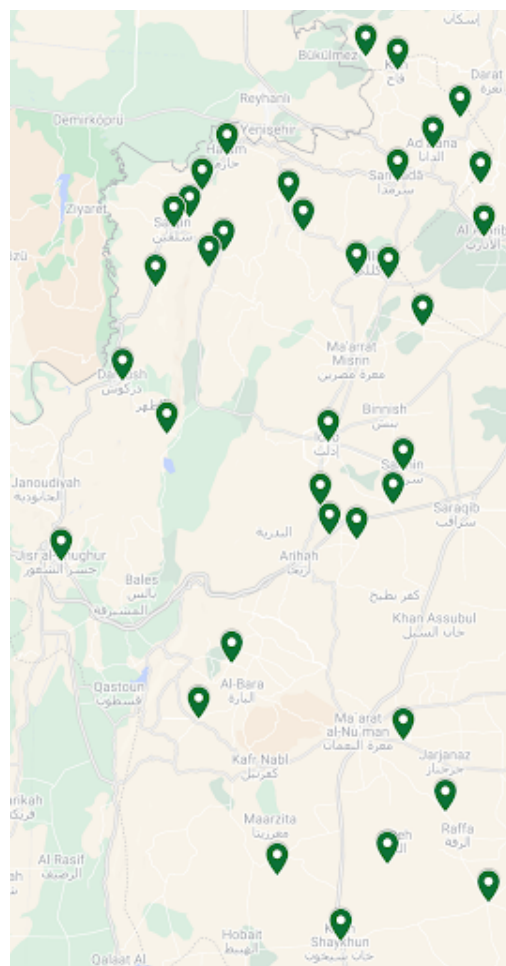
Figure 4: Locations where HTS conducted 'counterterrorism' raids against Islamic State cells in the greater Idlib region (July 2017-January 2023)

Before delving into the data on HTS' campaign against the Islamic State, it is important to better understand HTS' General Security Service (GSS), which is its law enforcement/intelligence body that