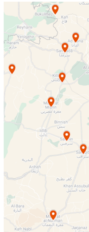
Figure 3: Areas in Idlib the Islamic State had prior territorial control in 2013 and where it also claimed attacks since 2015 in the greater Idlib region

There were 25 locales where the Islamic State had varying levels of control in the greater Idlib region in 2013 and 24 places where the Islamic State has claimed attacks in the greater Idlib region since 2015. Nine of those spots overlapped: al-Dana, Atme, Hazano, Kfar